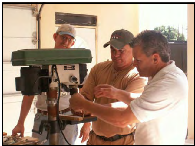
Life Church team members working on the NMB

Together, we are all working to fulfill the Great Commission. It takes "team work" to accomplish all that God has called us to. We are so thankful for the financial and physical help from everyone these past few months! May God bless you in abundance for your generosity to us and the ministry here in Guatemala! †