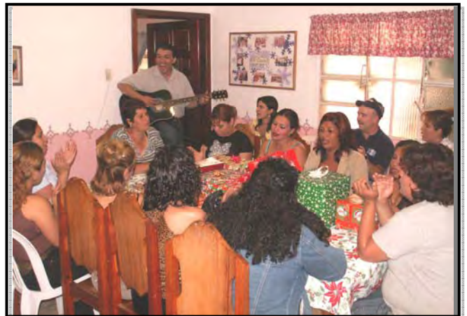
A time of praise & worship before opening gifts at El Oasis