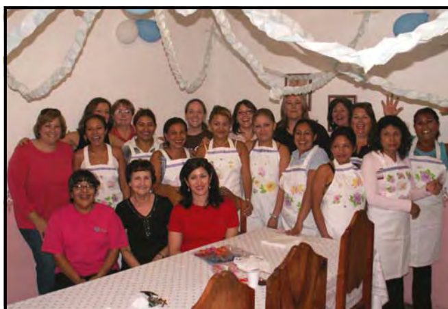
Women of Praise team with the women of El Oasis